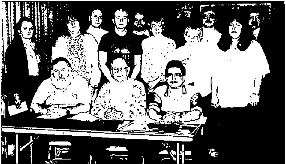
Some of the attendees at a New York State Meeting held in Auburn, NY on November 3, 1990.