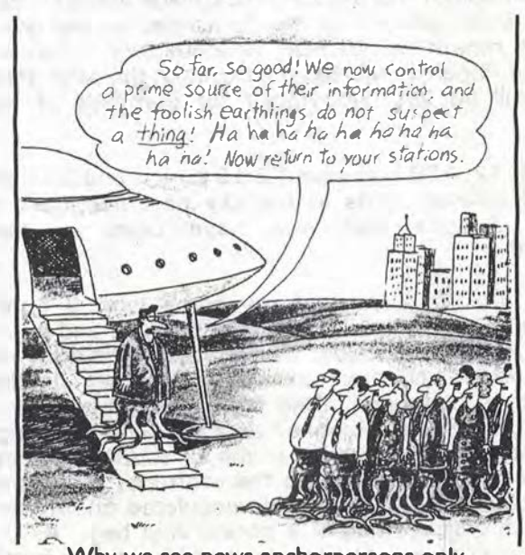
Why we see news anchorpersons only from the waist up.

Slide shows, videotapes, facts and figures were made available to attendees at both conferences, and the varied backgrounds of the speakers made for an eclectic but focused agenda. For those who were unable to attend either or both of the conferences, it will be well worth the effort and expense to attend in the future!