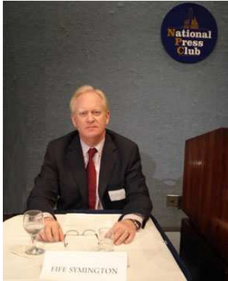
Former Arizona Governor, Fife Symington