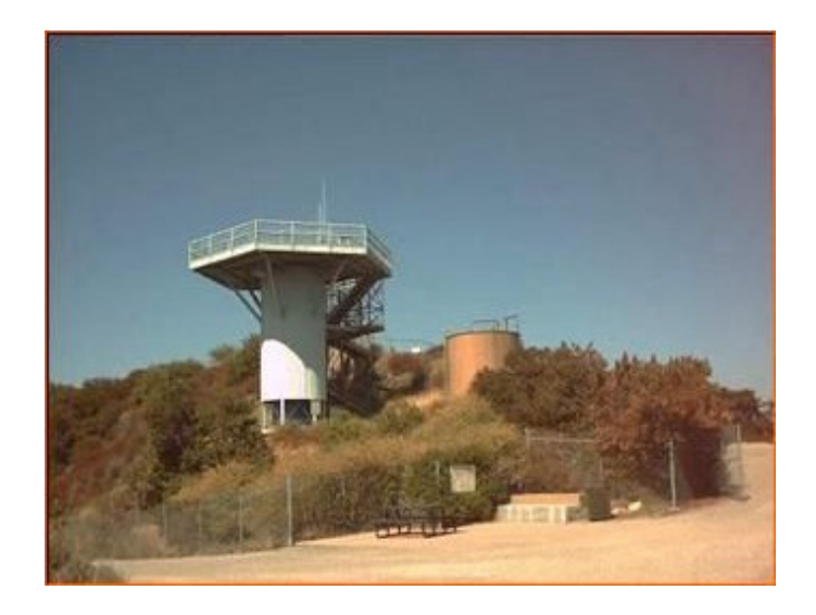
Old Nike missile radar site, top of San Vicente Mountain, 1999

Chet looked up and saw clearly that it was not a helicopter. It made absolutely no sound. He saw that all three of them were bathed in a very intense bluish-green light. The light was not at all like a beam of light, as it was extremely bright, lighting up a large area and making visible the surrounding grasses and shrubs.