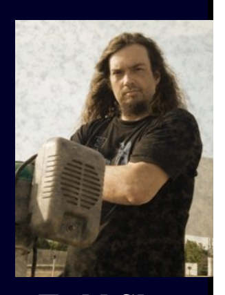
Todd Sheets Paranormal Files