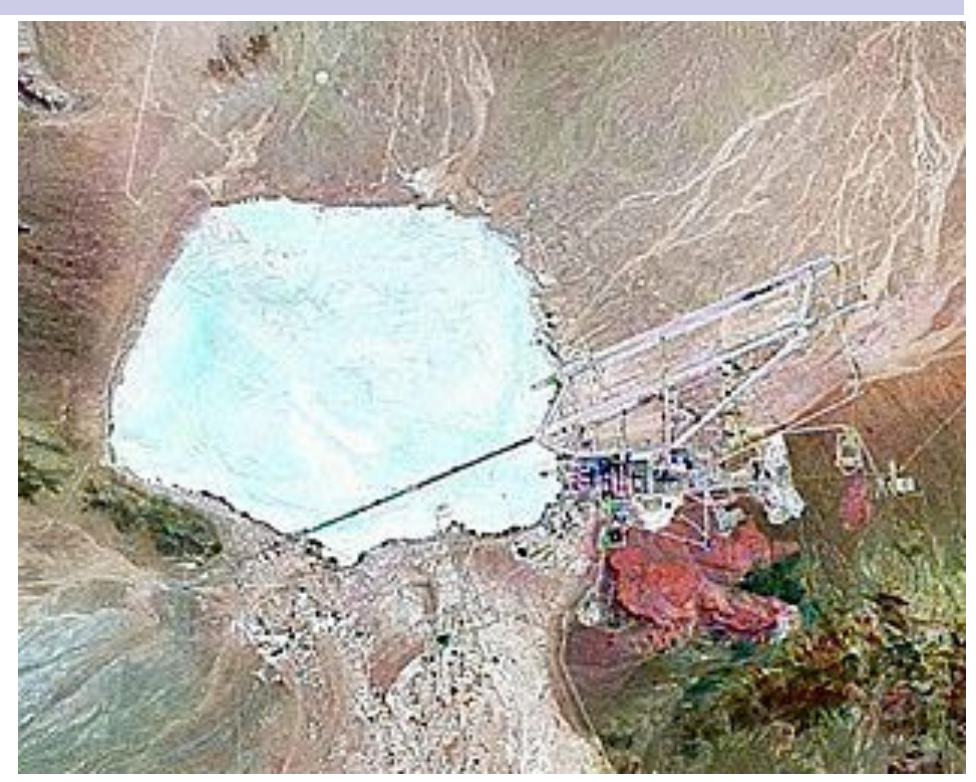
Satellite photo of Area 51