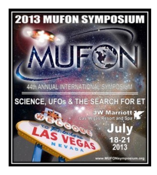
July 18-21 MUFON Symposium Las Vegas, NV www.mufon.com

St. Louis meets on the third Wednesday of the month, Kansas City meets on the second Monday of the month, and St. Joseph usually meets on the third Thursday of the month. See more information at misourimufon.org. Meeting announcements are also on the Yahoo Chat list.