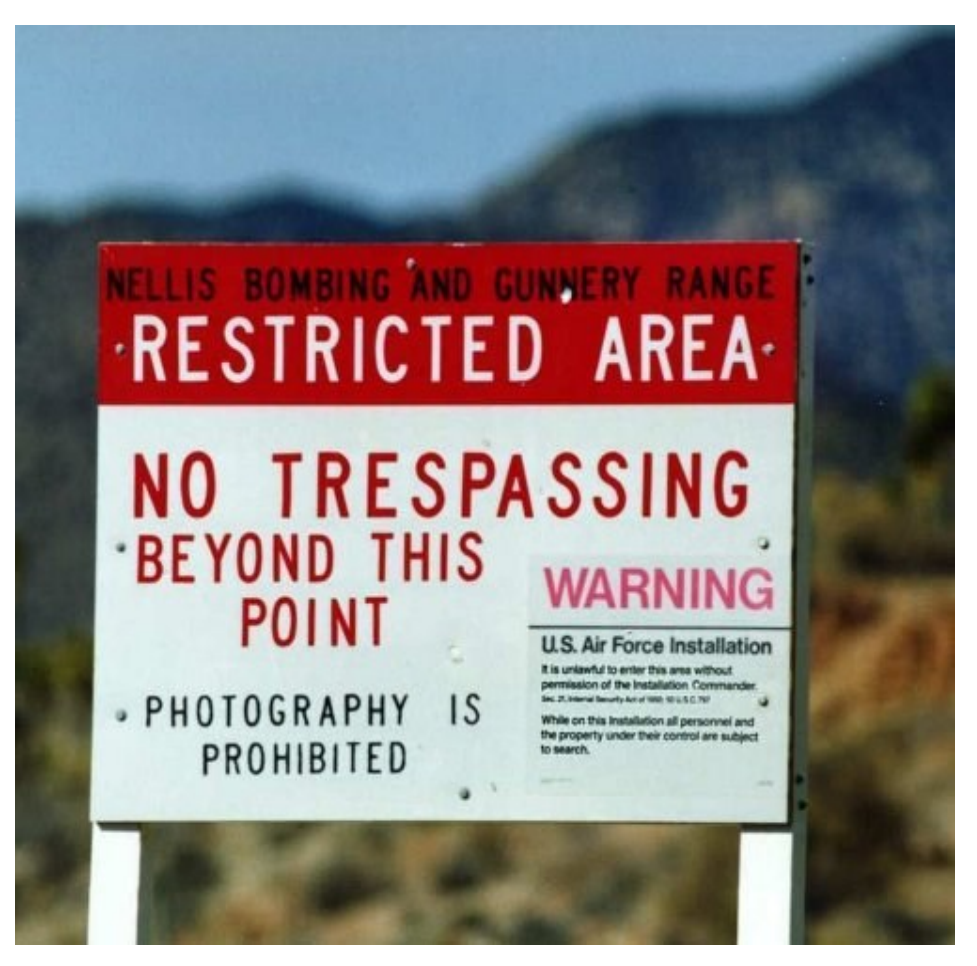
One of many signs around "Nellis Bombing Range"

• The space around and above Area 51 is off limits to unauthorized people or aircraft and a "shoot to kill" policy can be enacted if a person or aircraft fails to obey commands to leave or get out. This has supposedly never happened, but people have been fined up to $600 for trespassing.