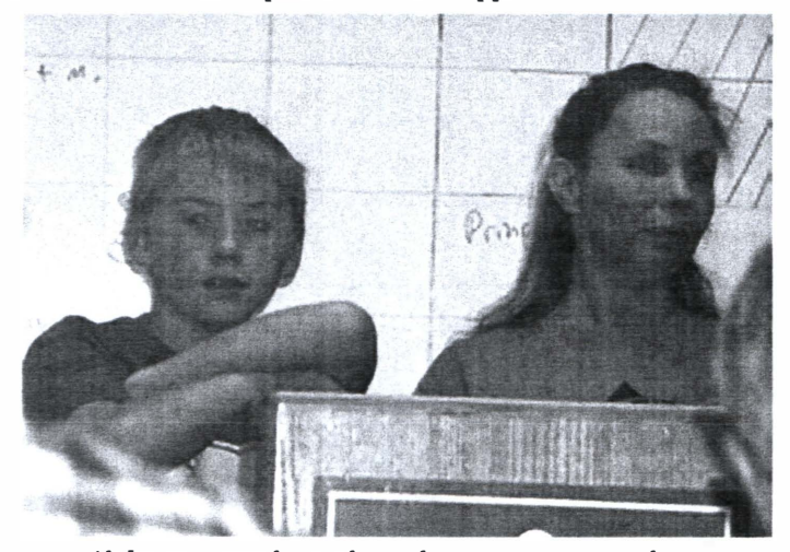
Abductees speaking about their experiences, above.

The woman commented that her somewhat rural neighborhood, located west of Portsmouth, Ohio, seems to be a hotspot for UFO and abduction related activity. She and others have observed an unusual number of black SUVs in the area, not owned by the people who live there. Men resembling the notorious Men in Black have also been seen. They are described as being Asian or cadaver looking. This woman and others have reported that personal items such as silverware (in particular forks), jewelry and film have turned up missing from their homes, to be replaced with a rock or other similar mundane item. These items are later exchanged again. For example, this woman reported losing a necklace from her jewelry box that had some sentimental value to her. A rock was left in its place. She later found the necklace hanging outside on a fence post, to discover that the rock that had earlier replaced it had disappeared.