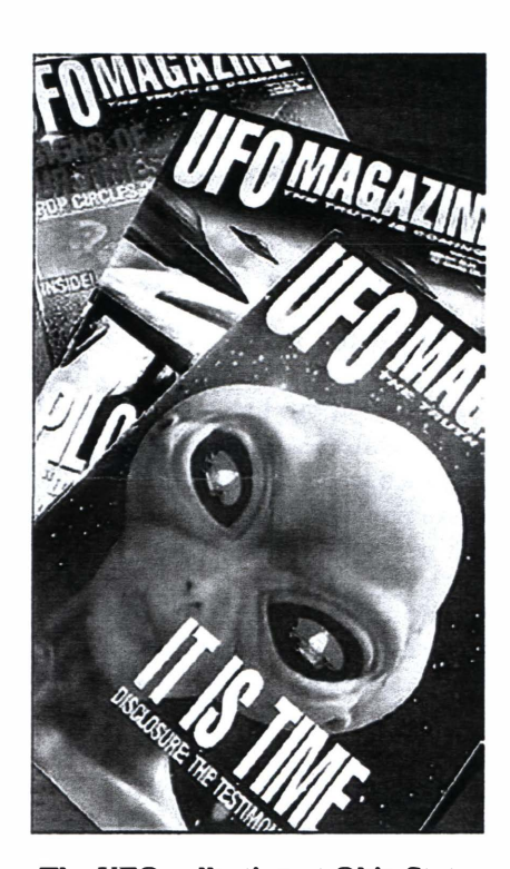
The UFO collection at Ohio State is one of the largest collections of its kind in the country and includes many copies of UFO Magazine.

The books in Ohio State's collection range from difficult-to-believe tales, such as the alien invasion depicted here, to UFO encounters that are more plausible.