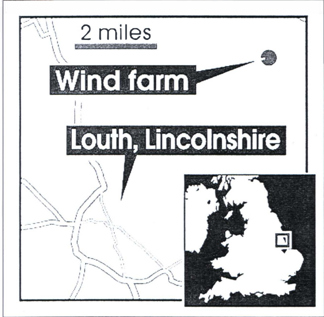
Impact ... map showing UFO sighting

Afterwards there was no trace of one of the turbine's three huge 65ft blades — ripped off in the collision.