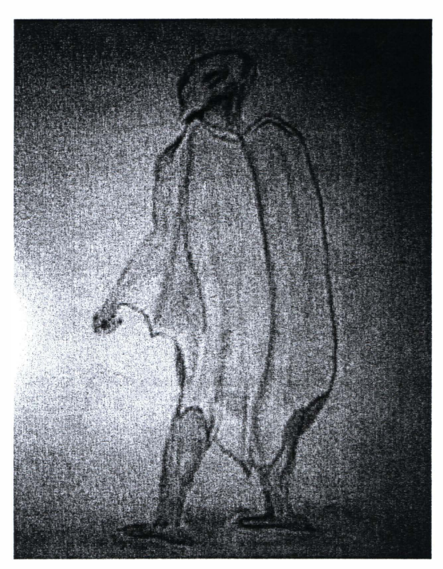
This sketch of the winged creature used with permission of the witness

At this point, the driver had his high beams on and watched as the creature walked in front of a yellow reflective road sign, then crossed the two lane road in three long steps and continued into a wooded area. What he saw was a humanoid figure that stood at least 8 feet tall that appeared to have smooth leather-like skin that was of either a darker tan or light brown color.