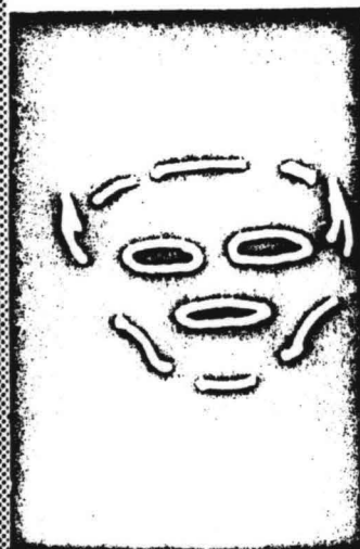
Witness' Sketch Of Sydney 'Monster'

Those who say they have seen it, however, are not to be convinced otherwise, and stick with their stories no matter how much they are made the subject of ridicule by others who have been there but have seen nothing.