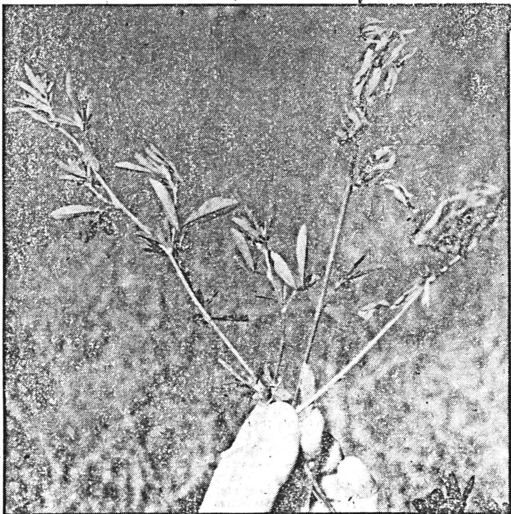
HEAT-WILTED — Wilted alfalfa flowers on the right stalk may have been killed by heat when a meteor apparently came down on a local farm Wednesday night. The healthy

A spokesman at the Seattle Center radar service said he received several reports from pilots who said they saw a meteorite falling into the Pacific Ocean.