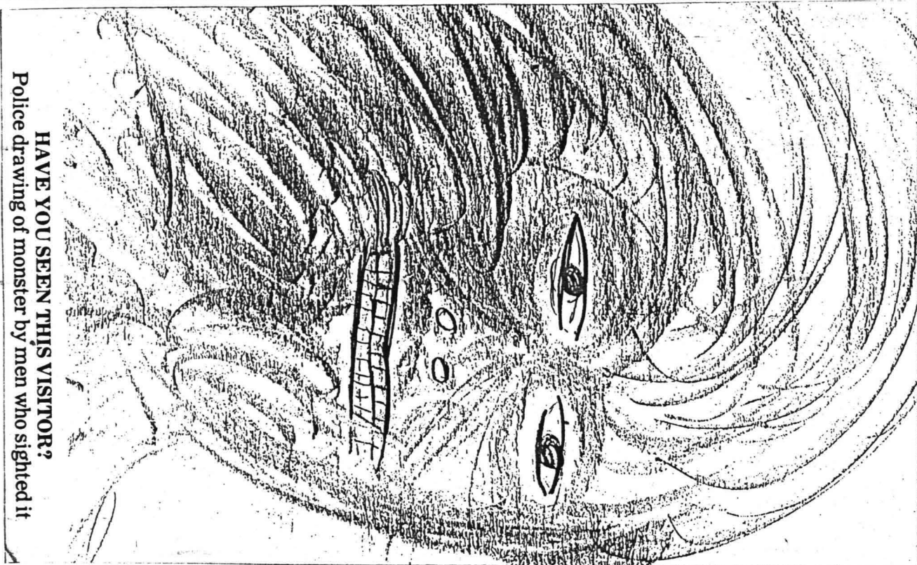
HAVE YOU SEEN THIS VISITOR? Police drawing of monster by men who sighted it

They said said the animal looked up at them for a few seconds, then disappeared into the brush that surrounds the area. *