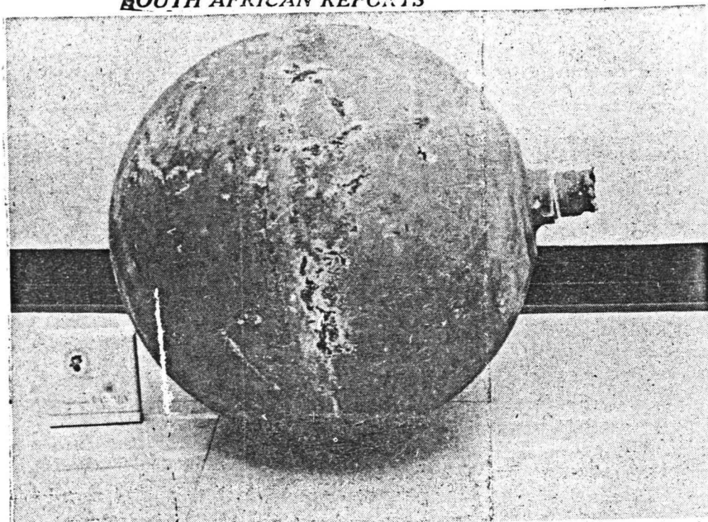
DIE eienardige balvormige voorwerp wat sowat twee weke gelede in die distrik Joubertina aangetref is. Dit word deur die polisie op Oudtshoorn bewaar.