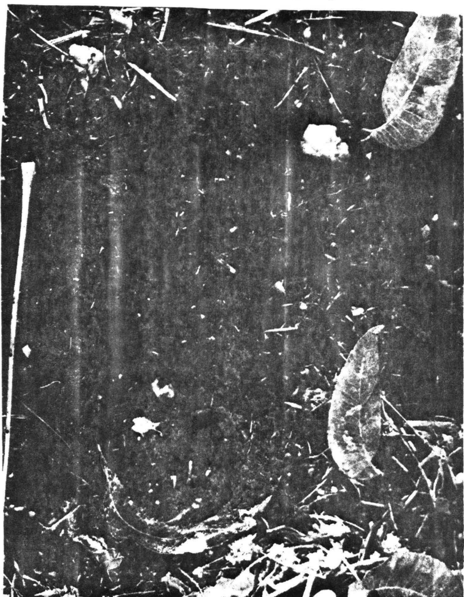
UNUSUAL FOOTPRINT in a yard on Walnut Street has been the subject of much discussion among residents of that neighborhood. Benton police officers have investigated the print, which is shown here in approximately two-thirds of its actual size. Some residents have reported seeing something that looks like a bear or a gorilla in the area but the reports have not been confirmed.