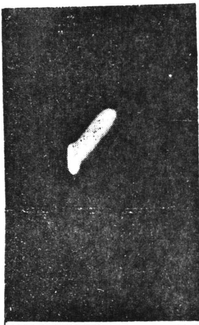
STREAKING ACROSS the sky is a bright unidentified flying object in Roane County. Several residents of eastern Kanawha County and other parts of Southern West Virginia reported sighting UFOs during the weekend. This photo was taken by a Roane County photographer for the state police.