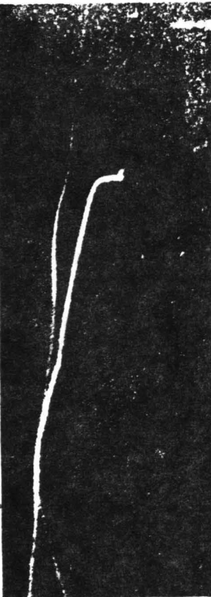
This 10-minute exposure photo taken by Tom Grey and Lake Ontario. The photo is one of eight taken Saturday night using a 135 mm lens mounted on a tripod with the Malcolm Williams of the Northeastern UFO Organization shows what they say are two UFOs zapping across the sky.

JOURNAL-RECORD, Oakville, Ontario, Canada - Oct. 25, 1978