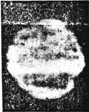
AN alleged UFO sighting over the Kaikoura area of New Zealand in January this year.

Now two men, a researcher and a psychologist