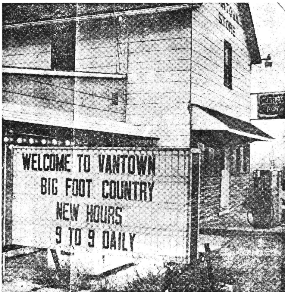
New sign identifies Bigfoot's stomping grounds

ONE WOMAN who claims to have gotten a glimpse of the creature was quoted as saying, "I know a deer and I know a cow when I see 'em, and this wasn't either."