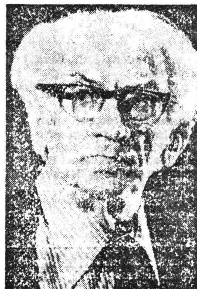
IMMANUEL VELIKOVSKY 'Worlds in Collision' author

But many of the theories Velikovsky advanced in the 1950s were