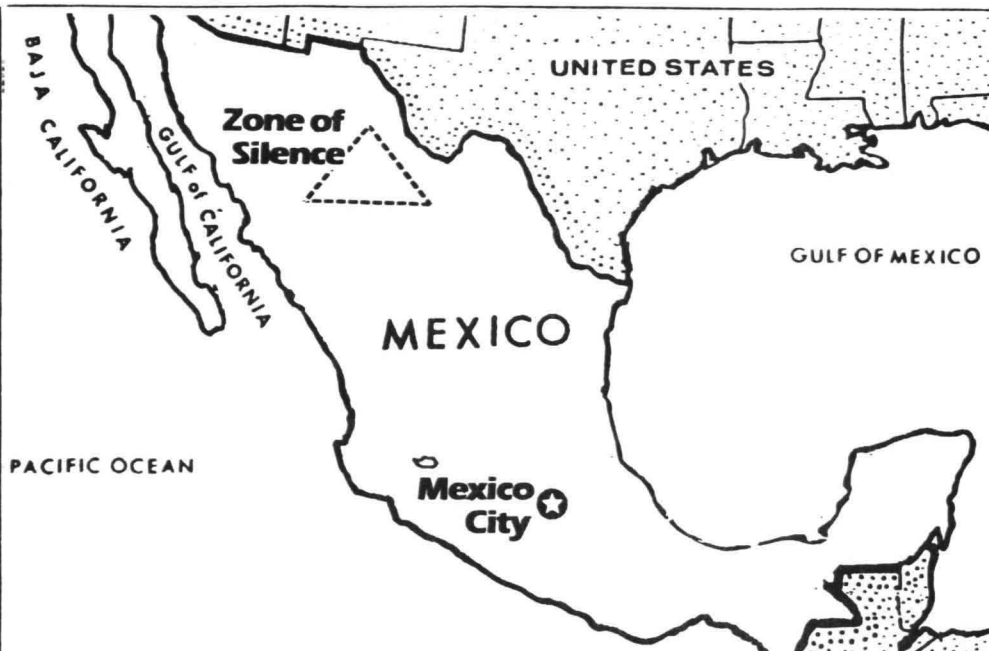
UPI Area marked shows "Zone of Silence" where gravitational and magnetic anomalies create a number of baffling and mysterious occurrences. The area lies on the 27th or "Mystery" Parallel which also runs through the pyramids of Egypt and the Bermuda Triangle.

The Zone lies about 120 miles north of the farming and industrial center of Torreon, in Durango, where the states of Chihuahua, Coahuila and Durango come together in a far flung triangle. This is the heart of vaquero country, between 104 and 107 degrees longitude, and squarely astride the 27th, or Mystery, Parallel, the latitude which passes through the Great Egyptian Pyramid at Giza, the site of legendary Shambhala in Tibet, and, of course, the infamous Devil's Triangle of Bermuda.