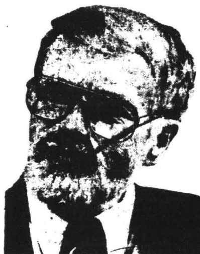
Roy P. Mackal

Mackal's theory is that the monsters are deep-water, snake-like, primitive whales that mostly inhabit the sea, but occasionally swim in the streams and then enter lakes like Loch Ness that have depths of 600 and 700 feet.